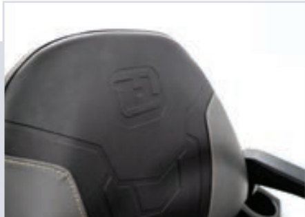
Higher-Back Seat and Added Padding For all day comfort.