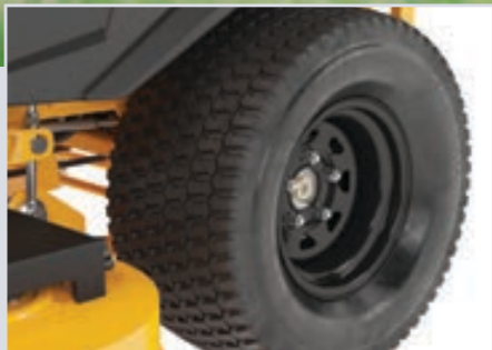
Commercial-Grade Torque Hydro-Gear® 21cc PY pumps and Parker TG wheel motors.