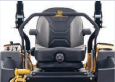
I3M™ Suspension Seat High-back seat with adjustable armrests and 3-inch travel range.