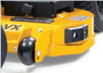
VX™ Deck Fabricated 7 ga. steel engineered for extreme vacuum to deliver an excellent after cut appearance.