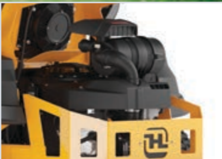
Commercial-Grade Engines Kawasaki® FX Engines backed by a 3-year warranty**.