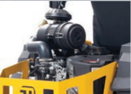
Commercial-Grade Engines Kawasaki® FX Engines backed by a 3-year warranty**.