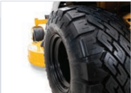
Larger 22" BigBite™ Drive Tyres