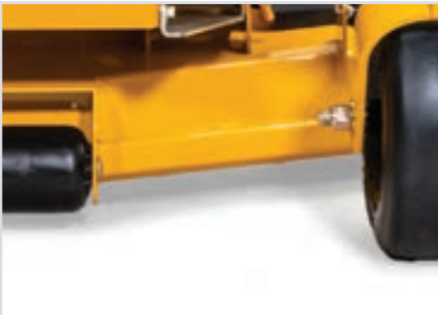
Commercial-Grade Deck 10 ga. with front bull nose bumper