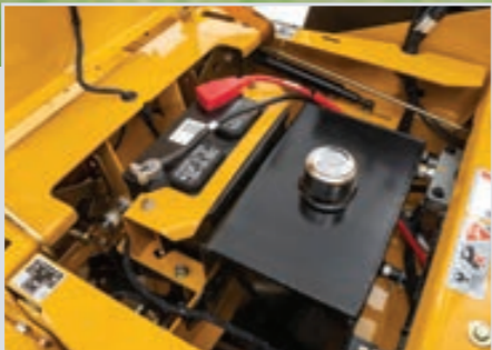
Heavy-Duty Hydraulics With 11 litre oil reservoir, oil cooler w/ fan & hot oil shuttle.